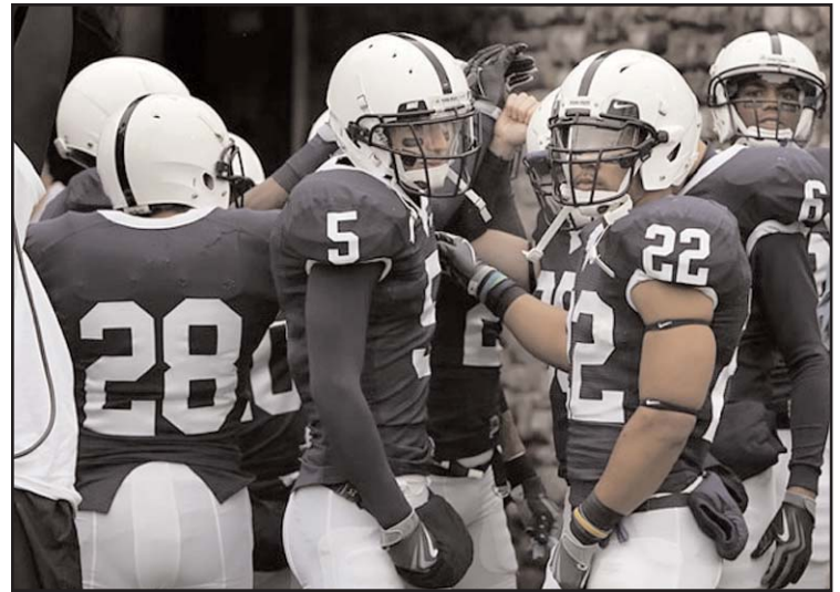
Nittany Lions gather on the sideline to celebrate another big play.